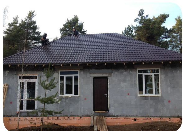
Only 3 workers can erect a solid construction within a few days and this in constant quality