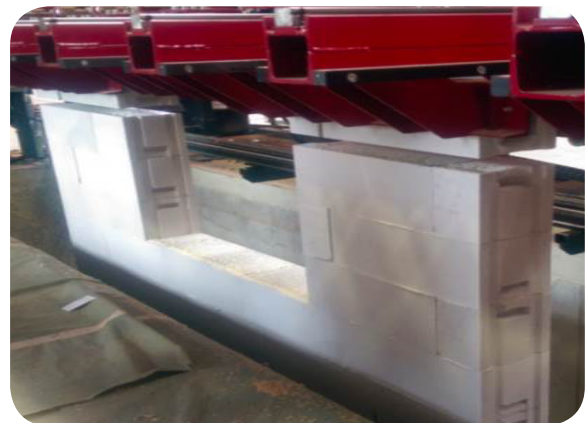
The blocks are now put layer by layer on circulation pallets