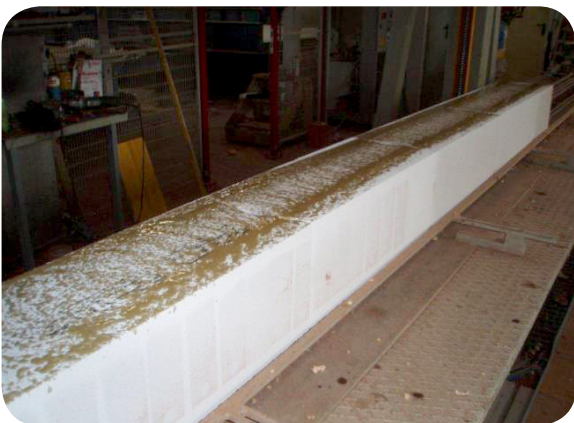
Special adhesive is applied on the blocks