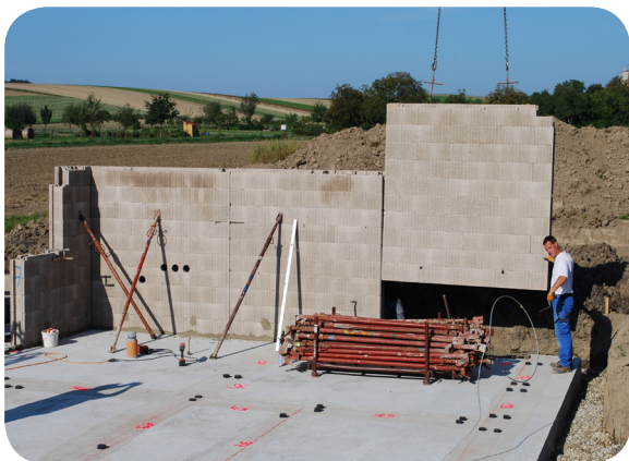
Setting of wall elements