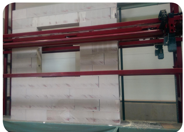
A finished wall after automated cutting