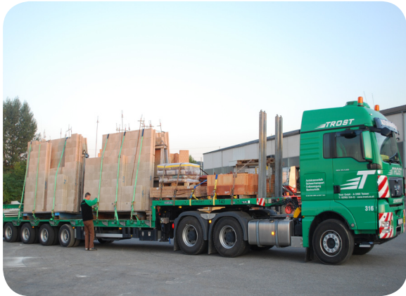
Delivery of wall elements to the construction site