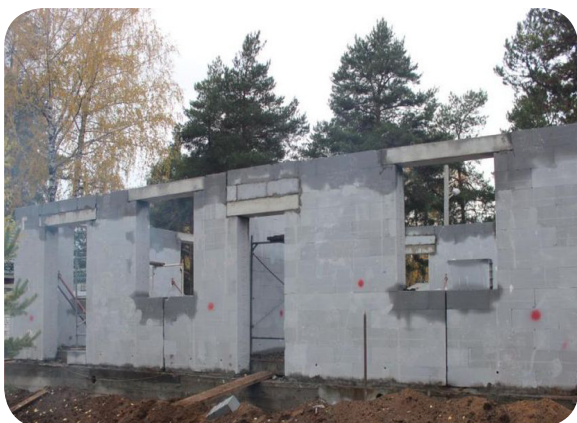
One floor incl. the ceiling can be finished in one day