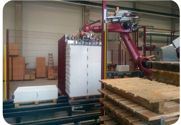
Robot unstacks the blocks from pallets and feeds the production line