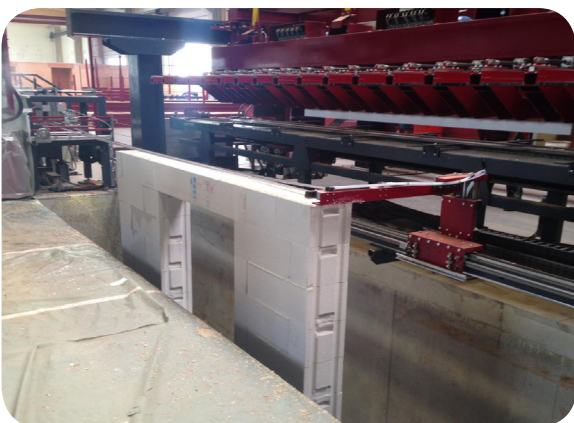
Insertion of carbon strips, if necessary