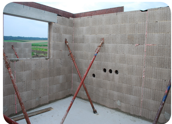
Fixing of wall elements with oblique supports