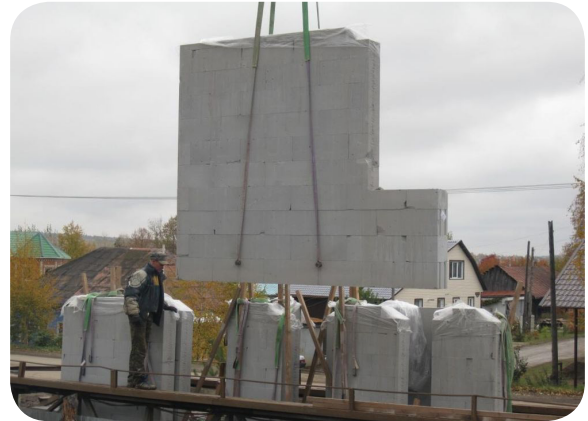
After the ground plan is chalked on the foundation plate the assembly can be started